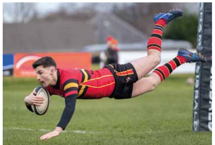
Stew Mel Vs Stirling Wolves 1