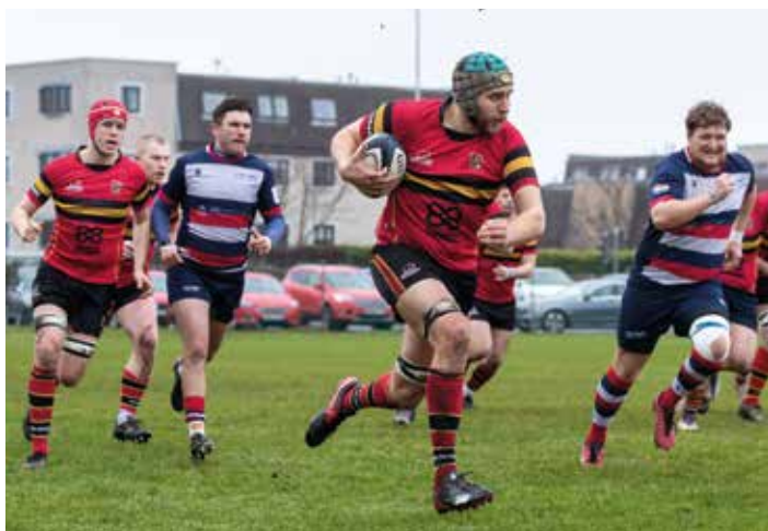
Stew Mel Vs Aberdeen Grammar